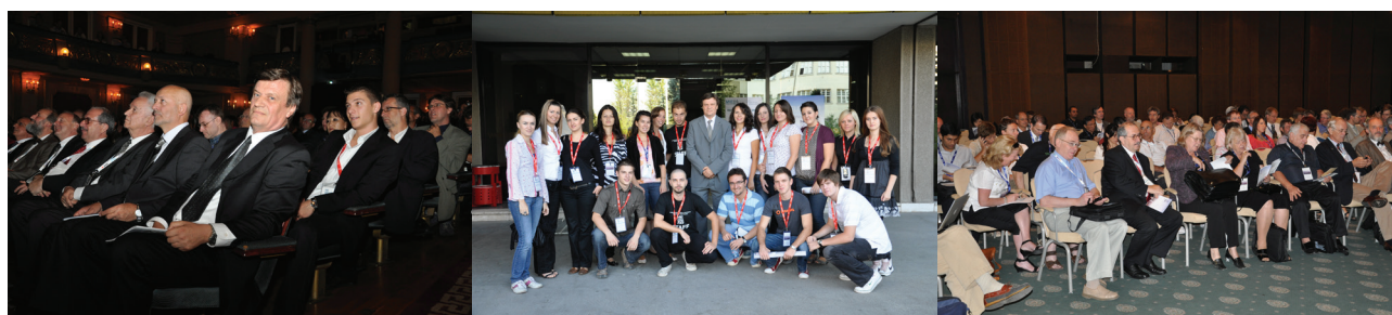
Figure 7. MIE Conference in Sarajevo: a) Opening ceremony; b) LOC staff; c) Participants of one of the main sessions (Sarajevo, 2009)

tatives of industry and consultancy in the various health fields.