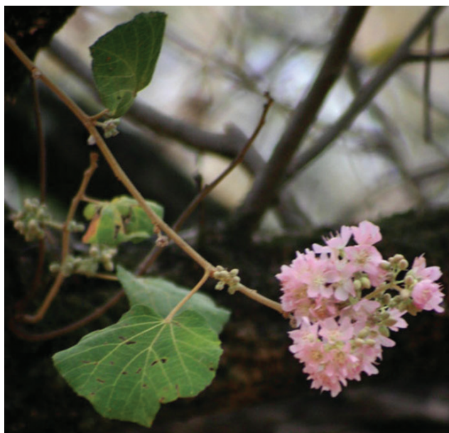
Figure 1. Dombeya rotundifolia : a branch showing leaves and flowers.

[9,10]. The flowers and bark of Dombeya torrida (J. F. Gmel.) Bamps are used as an herbal medicine for indigestion, while the roots are used for the treatment of chest pains and colds in East Africa [11]. In Tanzania, the root decoction of D. kirkii Mast. is used in the treatment of yaws and abdominal pains [12]. Pharmacological evaluations of D. burgessiae extracts revealed that the species possesses antioxidant and antidiabetic properties [10], while D. torrida extracts exhibited antibacterial and antifungal activities [11], and D. acutangula Cav. var. acutangula , D. ficulnea Baill., D. pilosa Cordem., D. populnea (Cav.) Baill., and D. reclinata Cordem. exhibited free radical scavenging and antioxidant activities [13]. The ethanol and dichloromethane extracts of D. burgessiae and D. cymosa Harv. showed cyclooxygenase-1 (COX-1) inhibition and antibacterial activities [14]. Dombeya rotundifolia is receiving increasing research attention as an herbal medicine in tropical Africa [15–21]. Due to its high demand as traditional medicine, the bark of D. rotundifolia is sold as an herbal medicine in informal herbal medicine markets in Gauteng province in South Africa [22,23]. The aim of this study was to review the medicinal uses, phytochemical and pharmacological properties of D. rotundifolia .