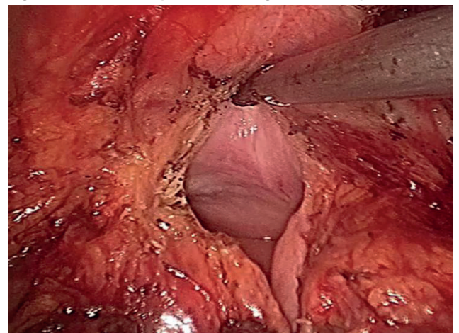
Figure 3. The perineal phase stopped when the rectovaginal peritoneal reflection was identified.

operative complications were defined and recorded as complications occurring within 30 days after surgery and were categorized according to the Clavien-Dindo classification (9). Late postoperative complications were defined as any complication occurring more than 30 days after the operation (9). Anastomotic leakage was defined according to the International Study Group of Rectal Cancer (ISGRC) classification (10), which grades severity based on the impacts on patients' clinical management.