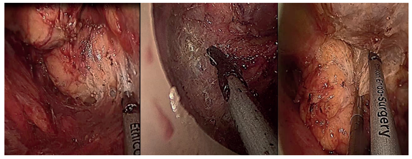
Figure 2. The down-to-top dissection along the avascular plane.