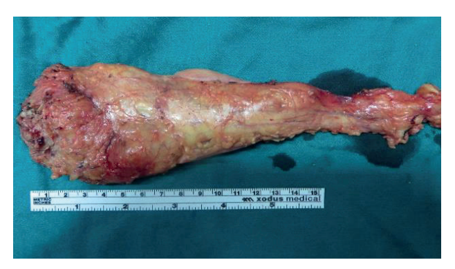
Figure 5. Specimens were examined by the pathologist

margin resection was defined as the distance from the sigmoid resection margin to the upper edge of the tumor, and the distal resection margin was defined as the distance from the lower edge of the tumor to the rectal resection margin. Fecal incontinence was evaluated using Kirwan's classification (12).