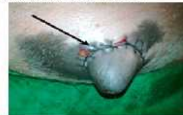
Fig. (4): the previous case after suturing