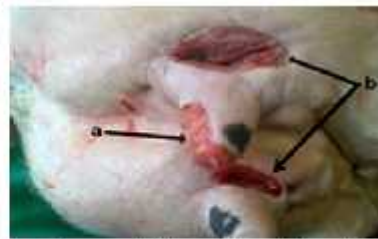
Fig. (2): superficial teat ulcer (a), and deep teat ulcer (b) in 6 years old cow