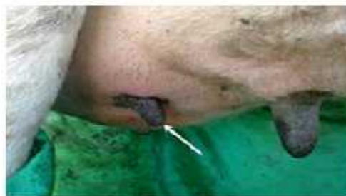
Fig. (23): very short teat in 6 years old cow