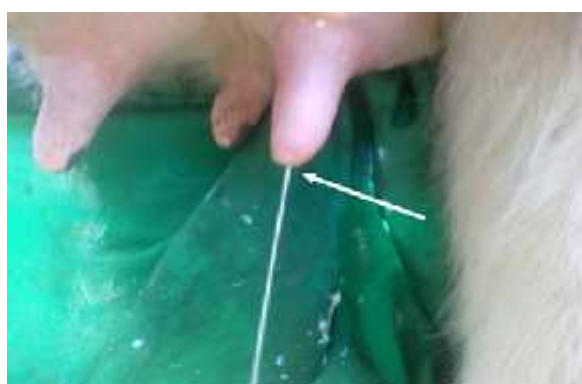
Fig. (26): Incompetent teat in 1st calving