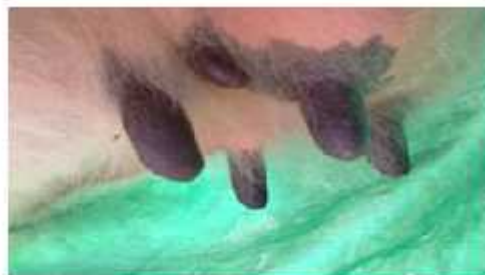
Fig. (21): extra quarter (hypermastia) in 4 years old cow