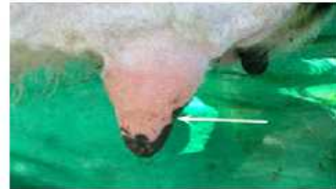
Fig (24): teat hyperplasia (bottle teat) in 7 years cow