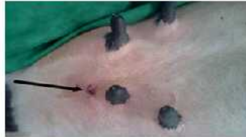
Fig. (18): showing the previous case one month after surgical removal of the extra teat