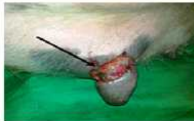
Fig. (3): incised teat wound in 6 years old cow