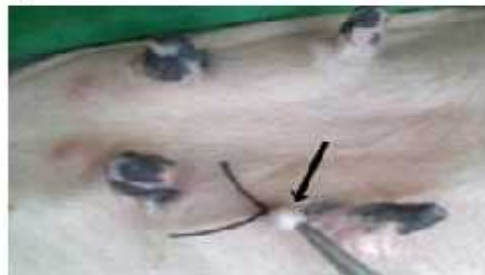
Fig. (19): webbed teat (extra teat IV) after ligation in 6 month old heifer