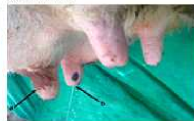
Fig. (8): (a) ischemic necrosis of one teat (b) continuous milk dripping (free milker)