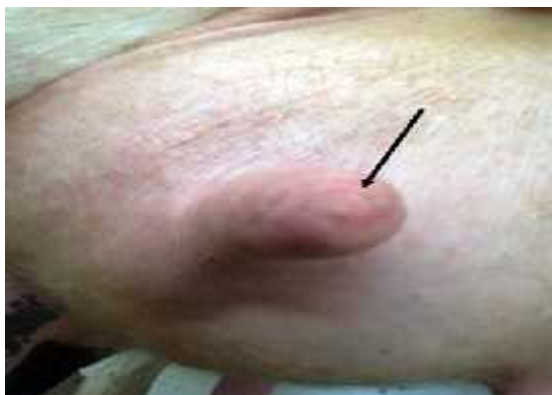
Fig. (25): Imperforated teat in 1st calving Heiferheifer