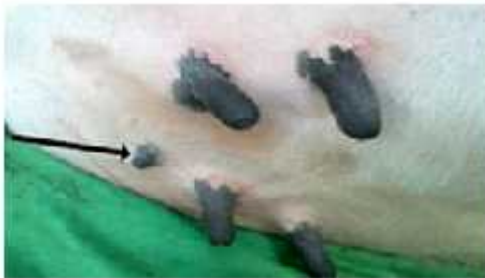
Fig. (17): an extra teat (III) in one year old heifer