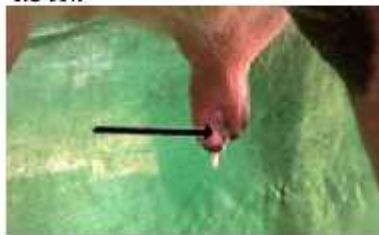
Fig. (5): old destructive wound in 6 years old cow resulting in free milker