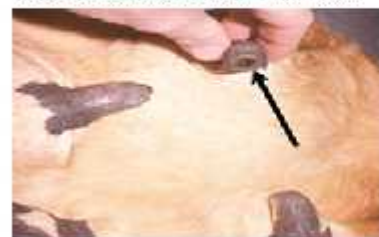
Fig. (7): black spot in 4 years cow