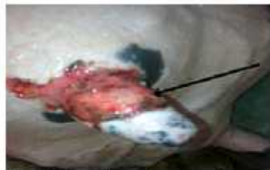
Fig. (1): teat ulcer in 7 years old cow