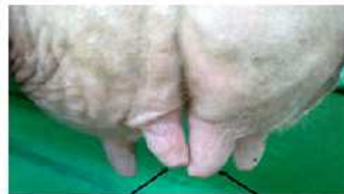
Fig. (22): closed hind teats in 5 years old cow